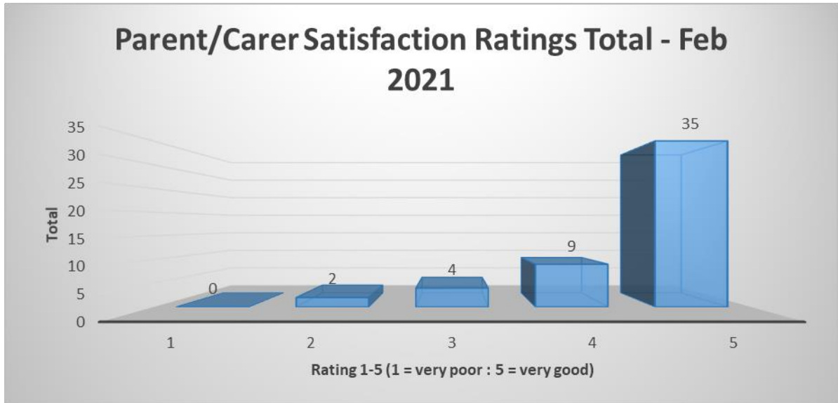
Graph to show rating responses to evaluation questions.